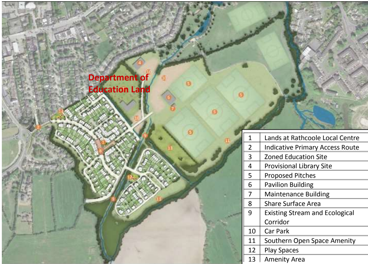
Figure 1 Draft Master Plan for South Dublin County Council owned lands in Rathcoole, July 2019.

What is the factual evidence based need for a new primary school? Where will it be located? Where will the new post primary school be located? What other options are there? What infrastructural supports are in place to support new schools?