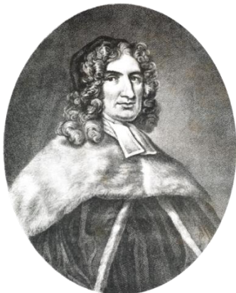
Archbishop William King of Dublin