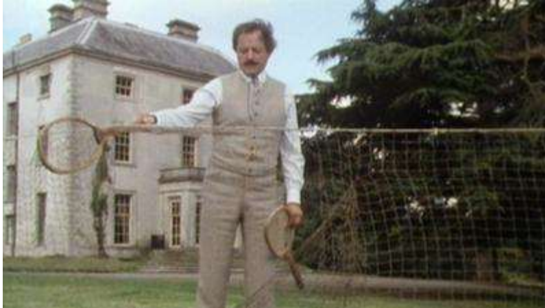
The Irish RM on the tennis court

The estate included a most impressive and extensive range of farm buildings.