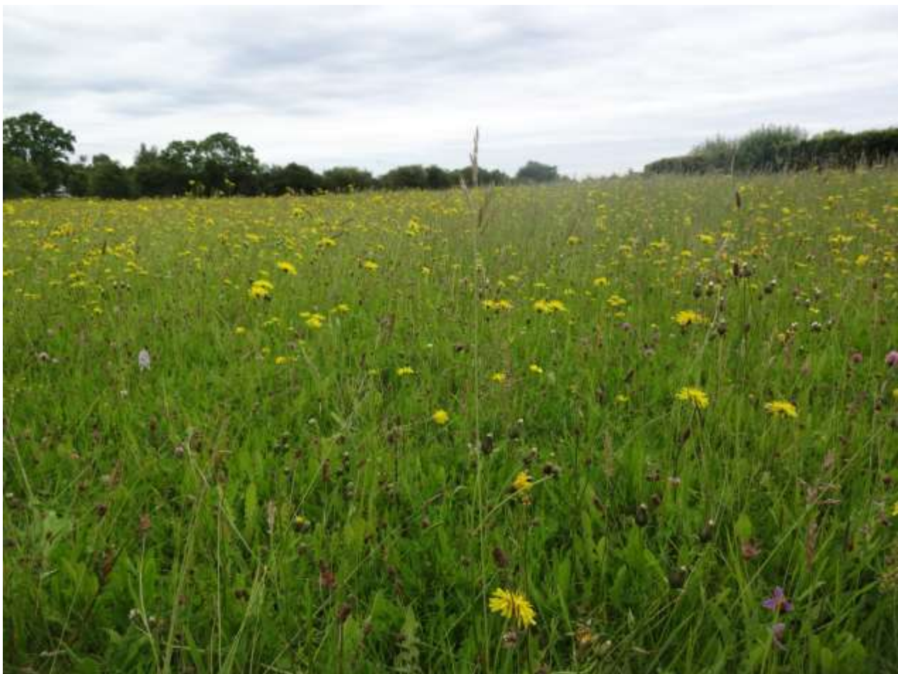
Photograph 1 Part of the GAA lands currently managed by SDCC as a Wildflower Meadow.